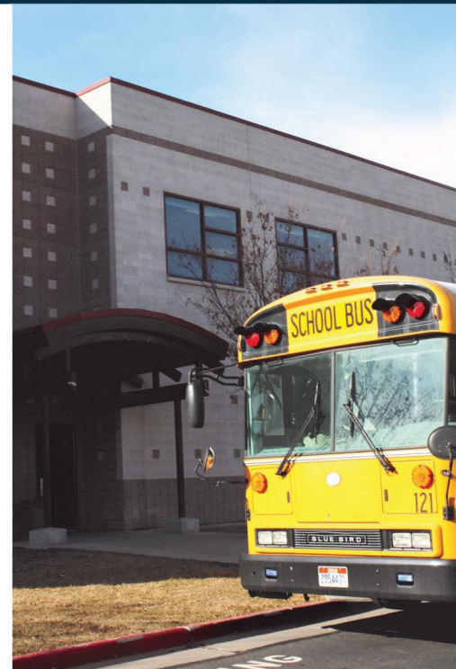
A school bus at Backman Elementary

Attendance is a crucial goal to the turn-around focus of Backman Elementary School. As the decline in attendance rates continued, Backman administrators connected with University Neighborhood Partners to help discover potential solutions. Through conversations with parents and educators, the need for a school bus to transport sixty-two K through 6th grade students from home to school and back became apparent.