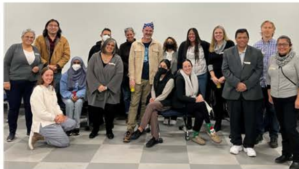
Staff members at UNP's Fall Retreat

As we continue to have more in person meetings and events, you will likely notice some new faces at UNP. While some of them came to replace team members who have left to pursue school or to advance through new opportunities, others represent our growing team.